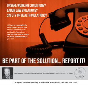
Labor Law Violations