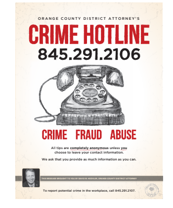
Crime • Fraud • Abuse Hotline

Public service announcement campaign earned Bronze Summit International Award for its 2014 anti-gun poster